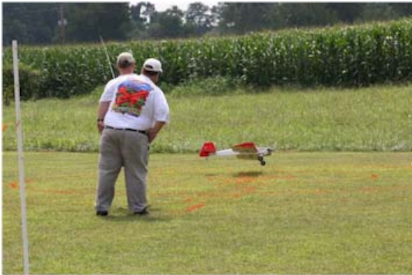
Is a two-headed flyer legal?