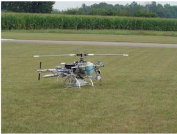
An awesome piece of equipment!