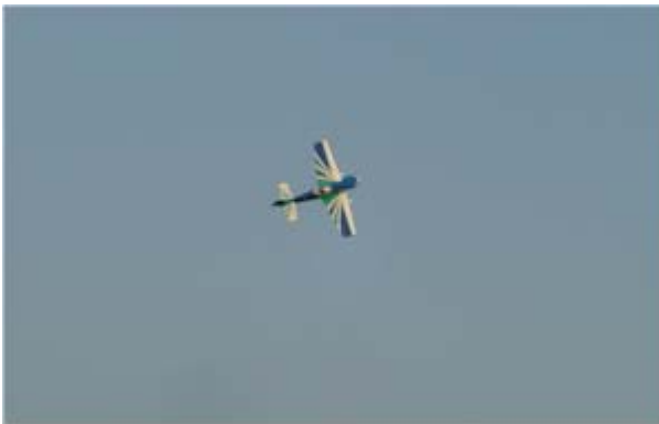
Another picture perfect knife-edge pass by Bob Groves just silly millimeters above the corn tassels ☺