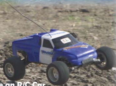
Drive an R/C Car