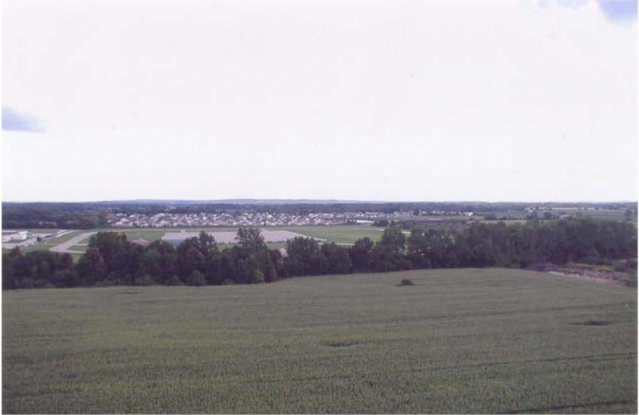
Looking due south toward the Indiana Police Academy.