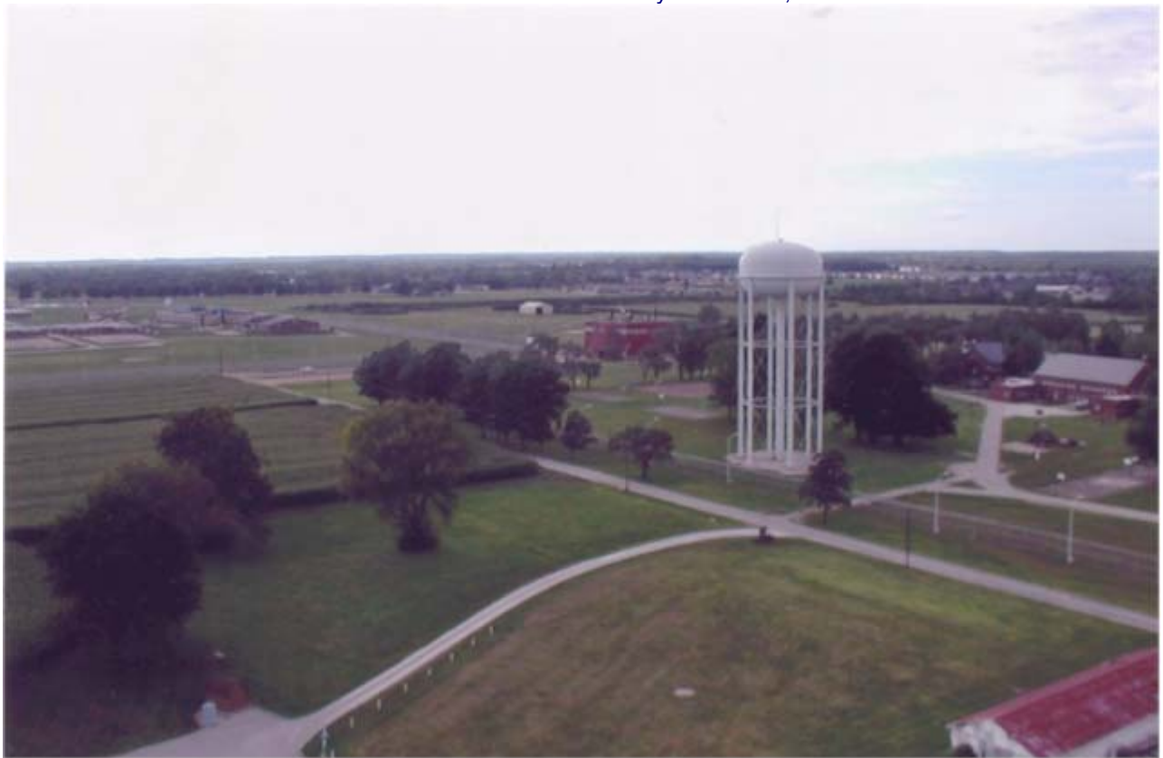
A view to the northwest showing our driveway into the field and the landmark water tower.