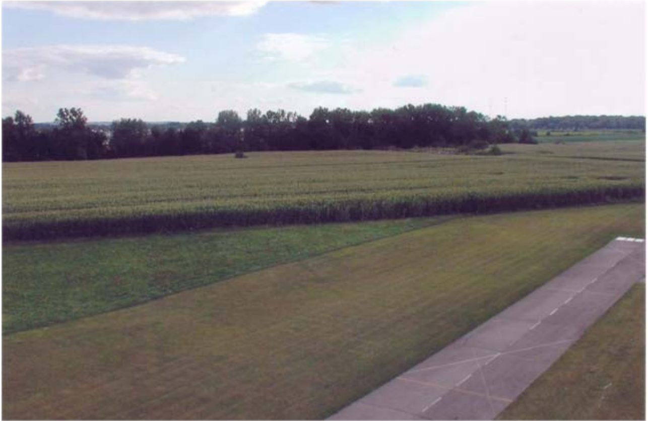
A view to the southwest...runway looks neat, huh?