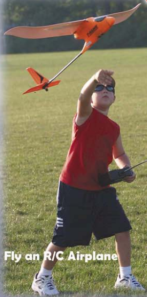
Fly an R/C Airplane