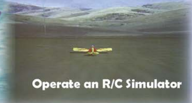
Operate an R/C Simulator