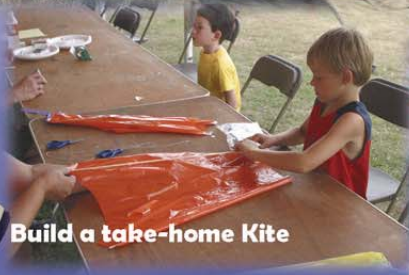
Build a take-home Kite