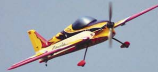
Watch an R/C Airshow