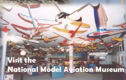
Visit the National Model Aviation Museum

Some Activities are program specific for Cub Scout, Boy Scout and/or Venturing, Look for more info in the near future.