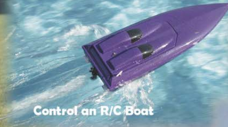
Control an R/C Boat