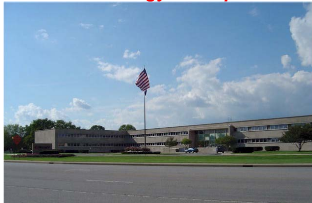
1000 East Washington Street Plainfield, Indiana 46118

The procedures for attending the meeting are as follows: